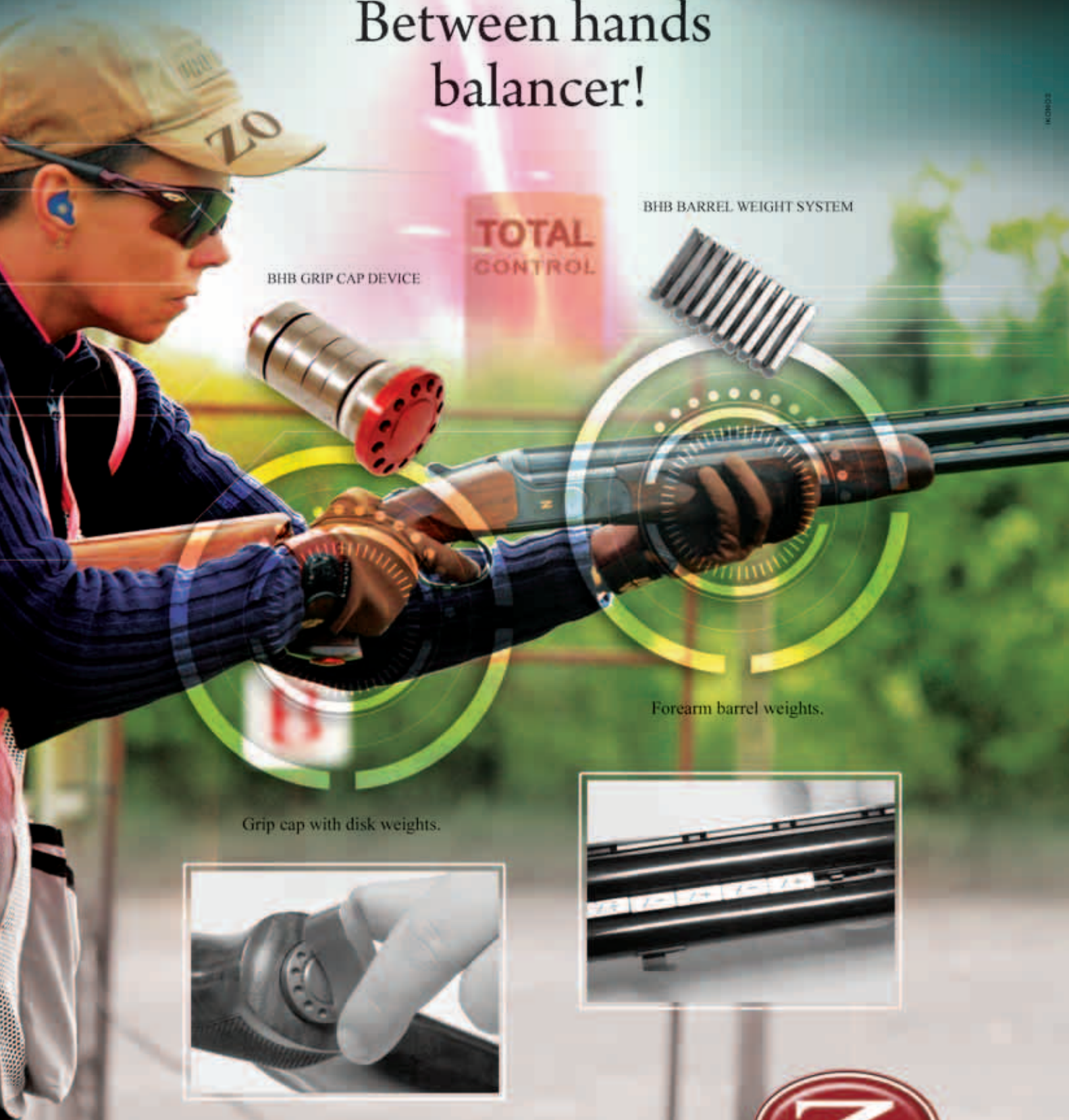
BHB GRIP CAP DEVICE