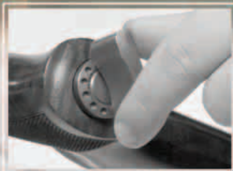
Grip cap with disk weights.